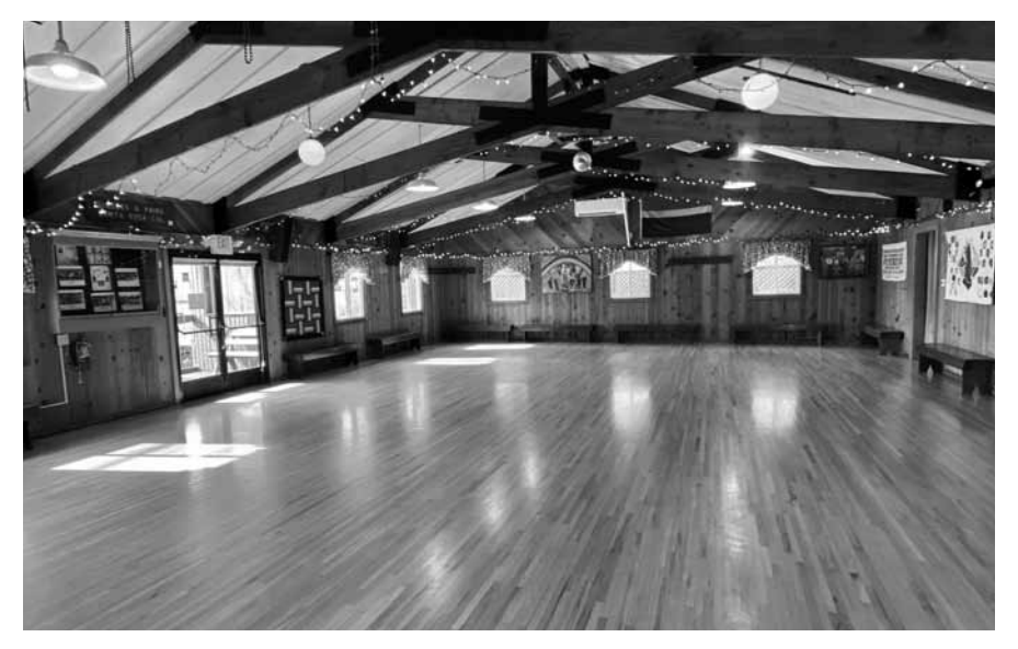
Wischemann Hall, featuring beautiful wood floors and air conditioning, was built by an all-volunteer effot in 1979.

REGISTER and pay online at redwoodrainbows.org/sandie , pay at the door, or use the form below with a check made out to Redwood Rainbows Dance Club, Inc. Mail to: Redwood Rainbows Square Dance Club, Inc., 465 Morris Street, Sebastopol, CA 95472